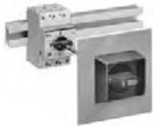
Switch cubicle mounting kit