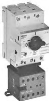
MS325 coupled to mini-contactor