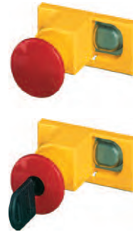
Emergency-Stop twist or key to release, red on yellow background