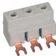
Power Feed Block