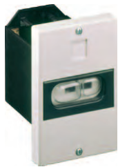
Flush Mounting Enclosure IP55 with integrated PE(N) terminal