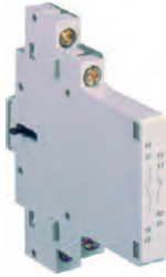
Auxiliary contact blocks for side mounting (3.5A/230VAC; 2A/400V AC)