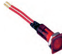
Indicator Light with neon bulb, nominal rated voltage: 220 - 240V or 380 - 440V