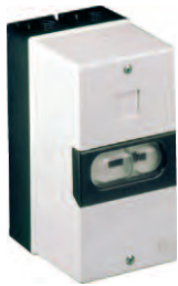
Insulated Enclosure IP55 with integrated PE(N) terminal; top and bottom each have 2 metric knock-outs