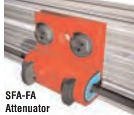
SFA-FA Attenuator (Red Housing)

These fiber optic safety devices are intended to be used with PICO-GUARD series systems in personnel-safety and equipment-protection applications.