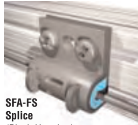
SFA-FS Splice (Black Housing)