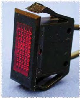
Indicator Light with Leads 125 VAC