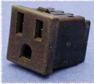
Single Receptacle 15A / 125 VAC