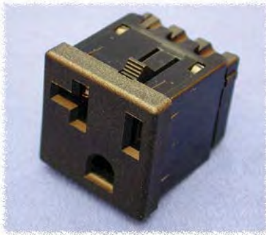
Single Receptacle 20A / 125 VAC