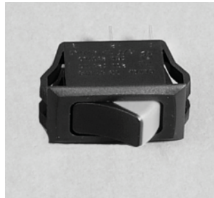
Rocker Switch 20A / 125 VAC