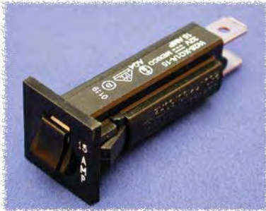
Circuit Breaker 15A / 125 VAC