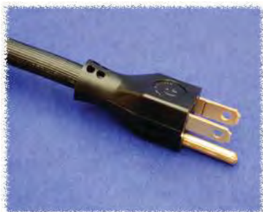
Power Cord (SJT or SJTW) & Plug (NEMA 5-15P) 14/3 - 15 Amp