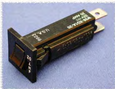
Circuit Breaker 20A / 125 VAC