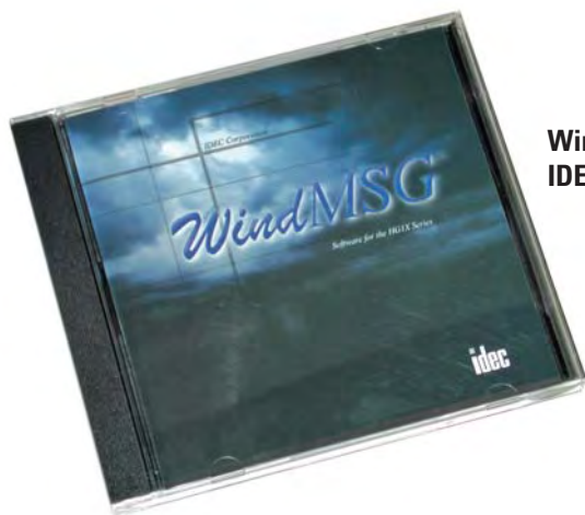
Windows based configuration tool for IDEC HG1X character displays