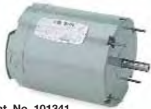
Cat. No. 101341