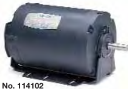
Cat. No. 114102