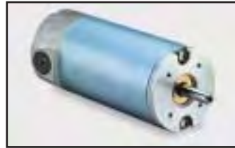
31 Frame, 3.11" diameter