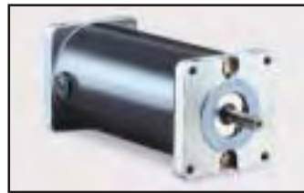
34 Frame, 3.38" diameter