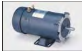
56C Face Mounting