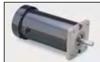
34 Frame, 3.38" diameter