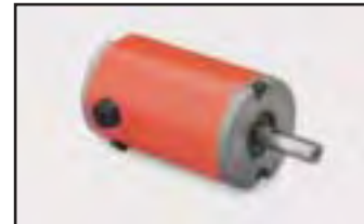
31 Frame, 3.11" diameter