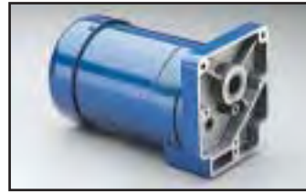
Custom Application Specific Mounting

④ Additional voltage ratings of 48, 60, 72 or other inputs also available.