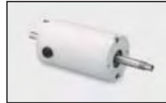
24 Frame, 2.38" diameter