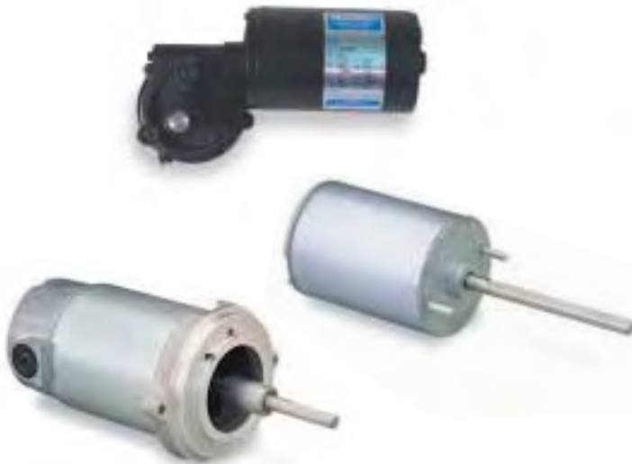
TYPICAL TRU-TORQ CUSTOM MOTORS

LEESON's application engineering staff is available, at no additional cost, to assist in developing the motor design best suited for applications.