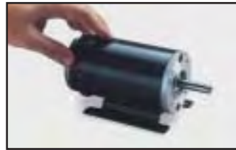
24 Frame, 2.38" diameter

For dimensions, see drawings A , B , C or D on page 32.