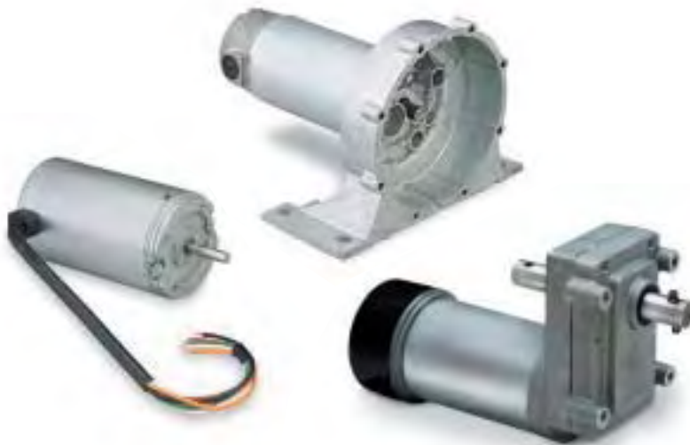
TYPICAL TRU-TORQ CUSTOM MOTORS

For dimensions, see drawings M , N , O or P on page 35.