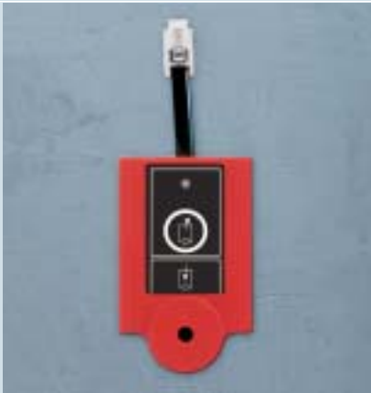
UBP11A parameter module for convenient data transfer and fast data backup

The MOVITRAC® 07 can be operated in both standard V/f control mode or field-oriented VFC (no encoder) . High overload capacity, integrated protection and monitoring functions and an extended temperature range are also standard features. An evaluation unit for the motor temperature sensor integrated into the MOVITRAC® 07 provides optimum motor protection. Not only that, the PI controller, installed as a standard, allows independent regulation of process variables such as flow and pressure.