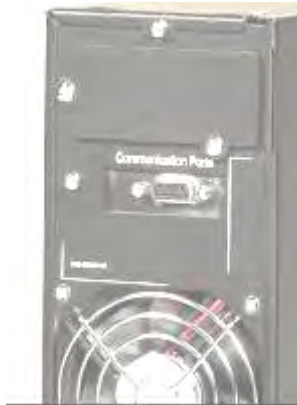
Location of Intellislot Port