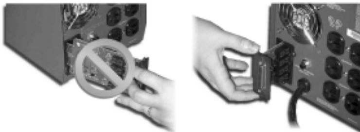
Card and Slot Orientation