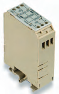
RS232 adapter plug